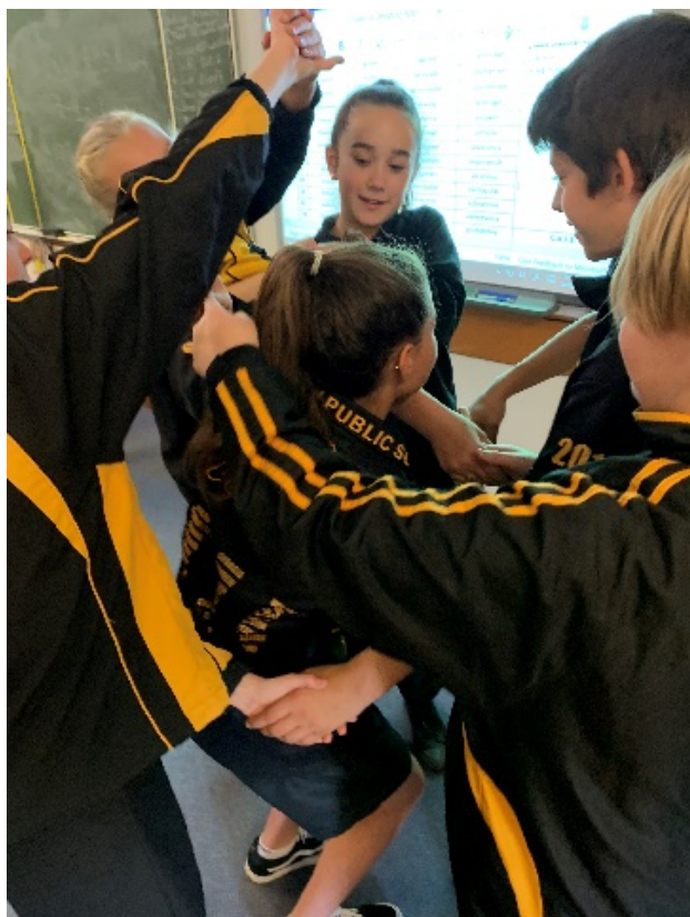
Participating in activities aimed at promoting our wellbeing focus of teamwork.

Students should now be well and truly underway with their preparation for the Science Fair, which is on Wednesday 18th September. There are two main parts to this experiment. Firstly, there is the Science Journal which accounts for most of the theory behind the experiment. Secondly, is the experiment itself which is presented on the day. After experiments are completed students will be able to complete the conclusion section in their Science Journal, which is due on Friday 20th September. We are looking forward to seeing some amazing experiments! Mr Ramage