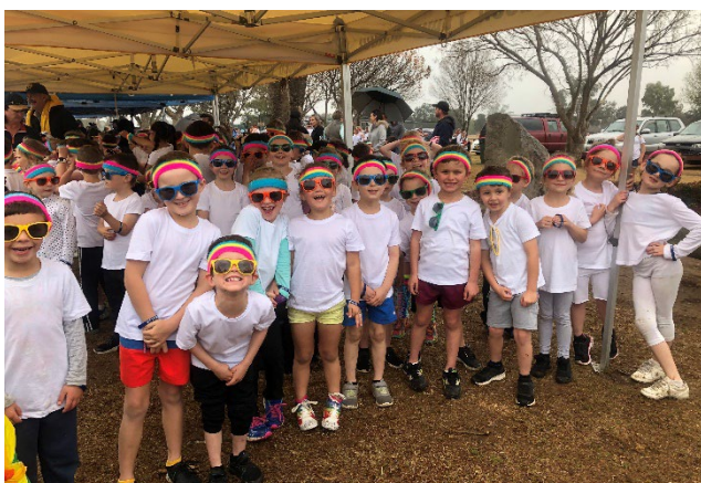
Let the fun begin!

Keep an eye out for a K-2 excursion note that was sent home with students yesterday.