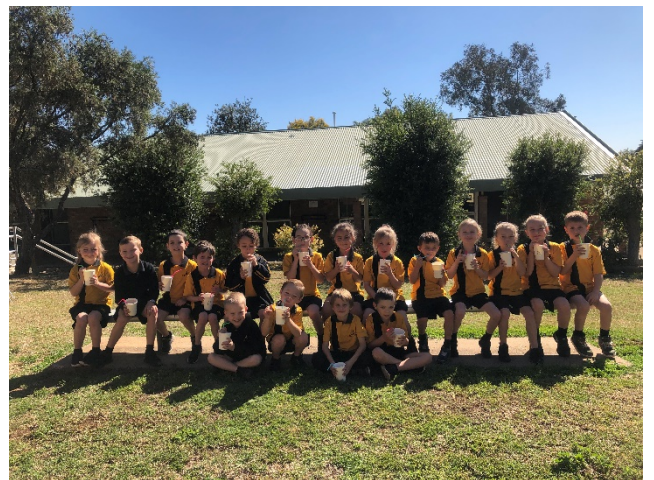
K Red enjoying their milkshakes and cupcakes.

Please return your K-2 excursion note and money to the office as soon as possible as the excursion is in Week 2, Term 4.