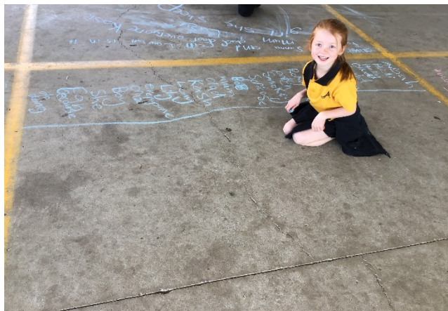
Words Are Fun!