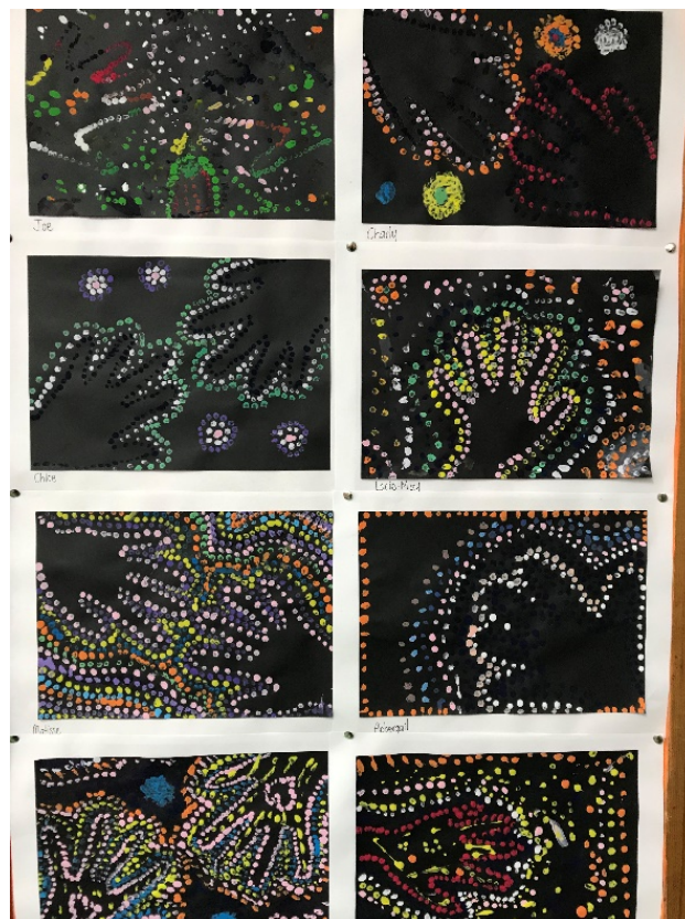
A small collection of class artworks.