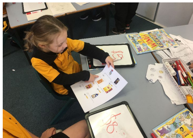
Shopping through the Coles mini catalogue