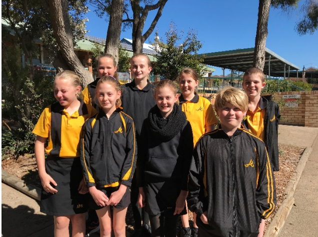
APS debating teams