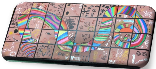
The Rainbow Serpent block artwork created by students in 3/4 Orange and 3/4 Black during NAIDOC Week.

Next week we head off to the Great Aussie Bush Camp. All notes and money were due last Friday. Please ensure any outstanding money is paid as soon as possible.