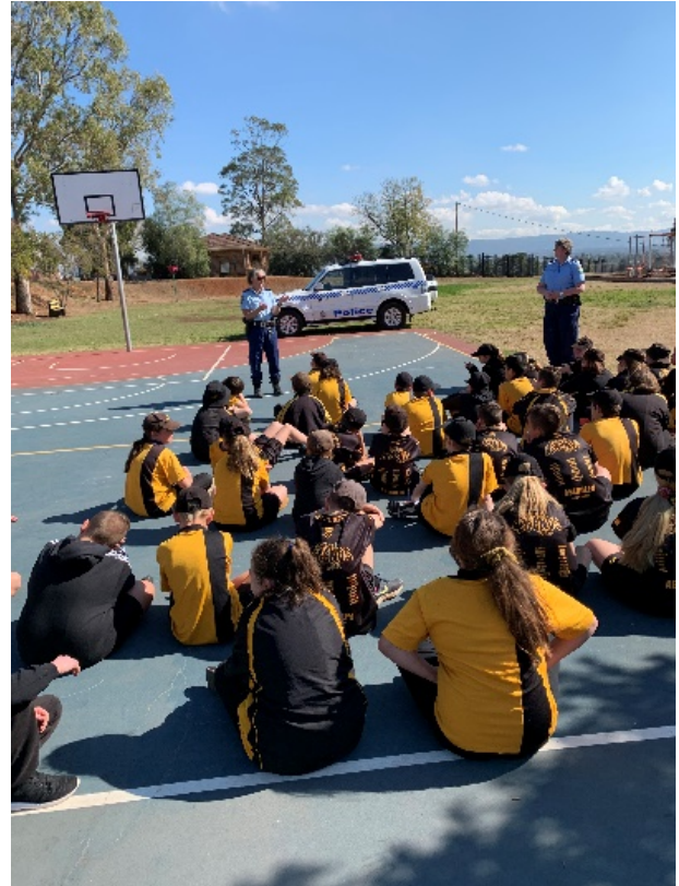
Listening to the police during their NAIDOC Week visit.

This term we are working towards organising our experiments for the Science Fair. Students should be actively researching their chosen field of study and be working on a focus question as well as an experiment that will help them to answer this question. Try and think of something new and interesting that has not been attempted before. Also remember to consider the cost of materials to complete your experiment.