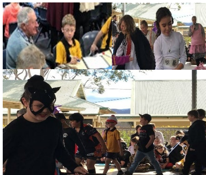
Fun at Book Week last Thursday!

Library - Students will have class time to borrow and return books from our school library every second Wednesday (even weeks). It is our library day tomorrow.