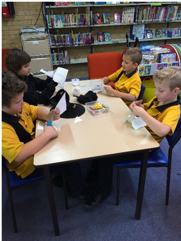
Working on 'Noni the Pony creations' at the Aberdeen library.

1/2 Yellow have been working on writing stories with strong characters. This linked well with Book Week because there were many characters running around in the classroom. Please remember to keep fundraising for the colour fun run this Friday, the class that raises the most money wins milkshakes and cupcakes and 1/2 Yellow love treats. If you haven't yet joined SeeSaw (there are only 3 of you!) please do so, because you are missing out on pictures and announcements regarding notes and class news.