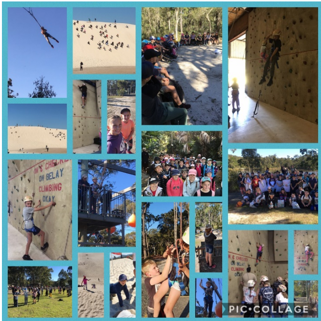
GREAT AUSSIE BUSH CAMP

In Week 4, Stage 2 attended the Great Aussie Bush Camp. A wonderful time was had by all and many students faced down personal challenges. A reminder that speeches are due to be delivered on Monday of Week 6. These were started in class and were to be completed at home over the past few weeks. Please encourage your child to practise their speech in front of you.