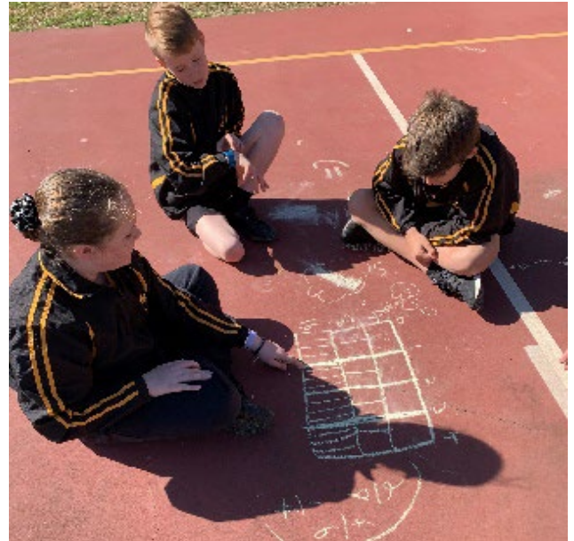
On Monday we took our equivalent fractions lesson outside.

This week, students in Year 5 will receive information contained in a Leadership package. This package outlines all the tasks that students will undertake with a view to attaining a leadership position in 2020 at Aberdeen Public School. Students will be given time at school to complete the package which will enable them to nominate themselves for the positions of school captain, student representative council and sports captain.