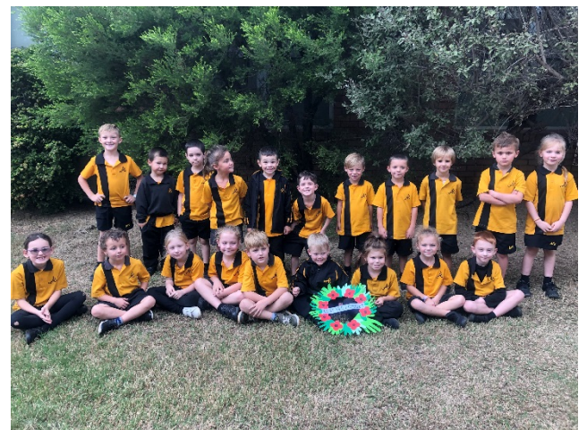
School Anzac Service