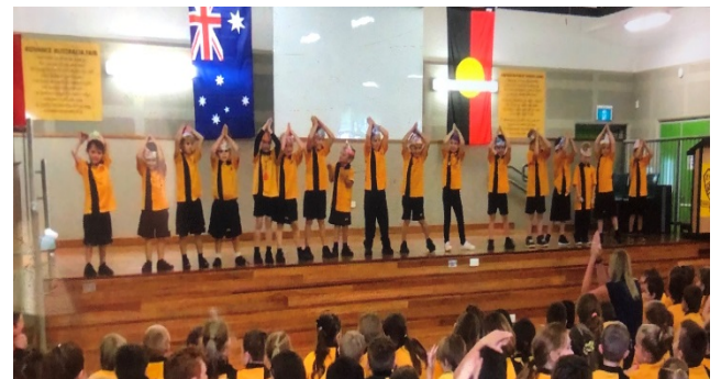
K Red looking dangerously cute as sharks during their performance.

Our class family tree is nearly complete, however, we are missing some family photos. Can you please send one into school or through on SeeSaw.