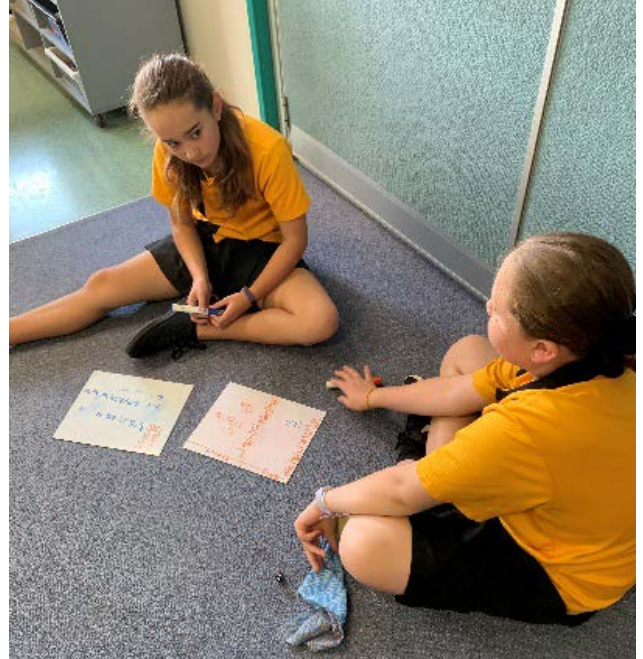
Multiplication Maths Games

During our maths sessions we investigate a range of concepts, review content through maths mental and complete activities to improve our problem solving skills. We also participate in maths games which are linked to curriculum content. The maths games allow us to learn in a fun and engaging way. Participating in these games also allow us to further develop our social skills as we learn to work as part of team.