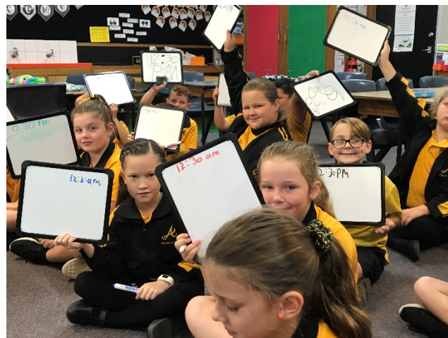
3 / 4 Black have started the term learning about the difference between am and pm time.