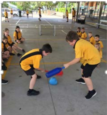
1 / 2 Yellow enjoying sport on the last day of Term 1

Welcome back to another busy term. Seeing as it is Week 1, now is the perfect time to check in with your child to make sure they have a pair of working headphones. We use these almost every day so they are a classroom necessity. If you have any issues in supplying these, please contact me ASAP. Now is also the perfect time to get connected on Seesaw if you haven't done so already. I've only had positive feedback from the parents who are already connected. If you would like to know more about this please contact me.