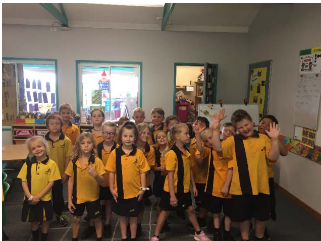
1/2 Yellow have been working on area and fractions. Here 1/2 Yellow is squeezing into an area of 24 squares.

We have been focusing on upgrading our writing by using verbs and adjectives. I'm happy to report, I have seen an improvement in students' understanding of higher modality words, e.g. 'good' can be upgraded to 'wonderful'.