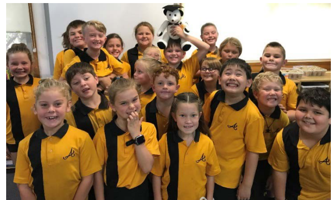
We won Tidy Ted this week!

On Thursday, we have The Biggest Crunch – students are reminded and encouraged to bring in a crunchy vegetable to crunch on as we try to set a new record for the largest and loudest simultaneous crunch.