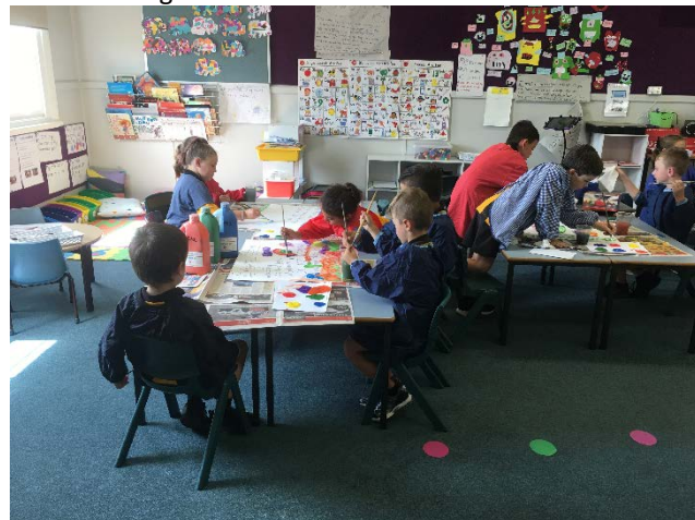
Creating posters for our work spaces.

We have been looking at spaces in our classroom and how we can treat them respectfully. We made some posters to let all of our guests know.