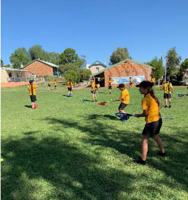
We love learning to play Lacrosse

The Stage 3 teachers have been attending professional learning to gain more tools to assist our students to become better writers. The overarching message is that we are encouraging a more academic and professional writing style. To achieve this we have begun by limiting the amount of contractions we use in our writing. We are now focusing on packing noun groups by constructing 'super sentences' to make our writing even richer.