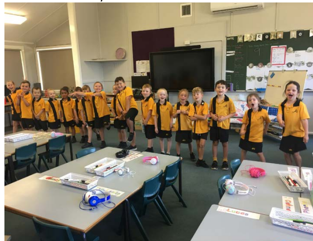
Pattern making in K/1Purple

Our class assembly item will be in week 11.