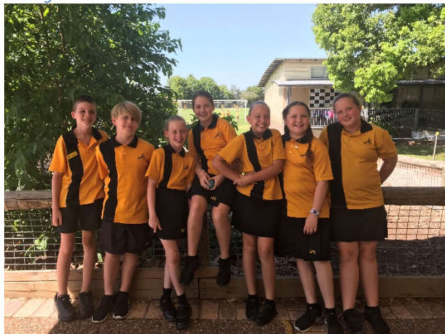
Debateurs hone their skill at Debating Gala day in Singleton