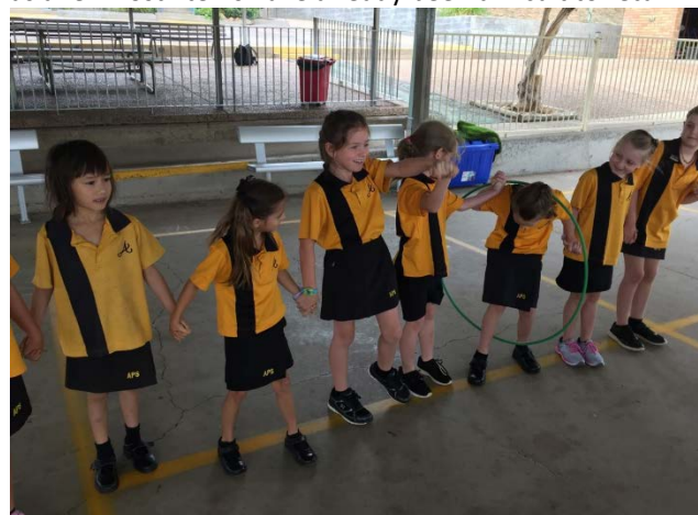
In class we are working on building our class culture by doing team building and get to know you activities. This is to ensure students have a positive and supported year in 1/2 Yellow.

Please ensure your child's belongings are clearly labelled, as a few 'lost' items have already been difficult to return.