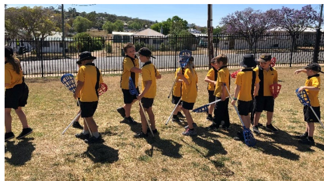
1/2 Yellow practising their sportsmanship skills.