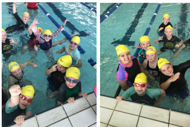
Having fun and learning during Intensive Swimming.