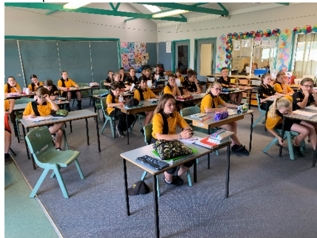
Working hard in 5/6 Green

Students in Stage 3 have been very busy. Our Year 6 students have been hard at work preparing for our mini fete this coming Wednesday and we look forward to what they have in store for us. Year 5 students have been busily working through each component of their chosen leadership package. It is wonderful to see the dedication and effort that is being displayed by all our Stage 3 students to complete these extra-curricular activities.