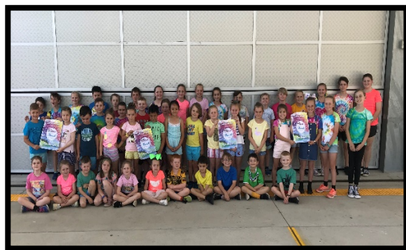
Blast from the Past: Colour Your Threads for Pos Ed Day 2018

COST: Gold coin donation appreciated but not required for students to participate.