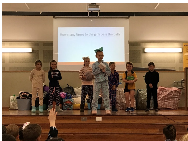
'Born to Perform' 2/3 Red performing at the school assembly on the last day of Term 2