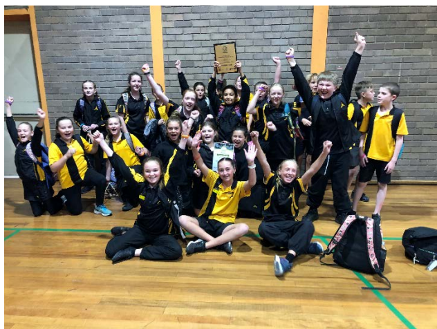
SCHOOL CHAMPIONS AT THE SCIENCE AND ENGINEERING CHALLENGE!

Wow! Aberdeen students are going from strength to strength. First, it was success at the Eisteddfod, then our debaters attended a GALA day at Singleton Heights on Wednesday and to cap off the week, our Stage 3 Team took out first place at the Science and Engineering Day in Muswellbrook. I am so proud of all of you for putting your hand up to have a go and try something new.