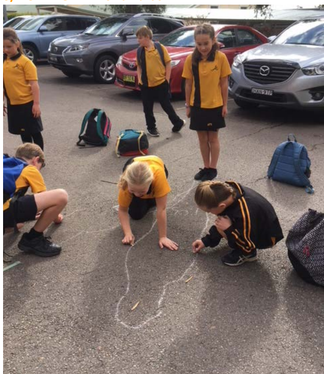
3/4 Orange tracing and tracking their shadows at different times of the day.

As Stage 2 continue to learn about the relationship between the Sun and the Earth, 3/4 took some chalk outside and tracked our shadows at different times of the day. This was a lead into this week's Science lesson where students will be conducting a shadow stick investigation. They will be involved in planning their investigation then observing and measuring shadows. Finally, they will record their findings and create tables to represent and compare their results.