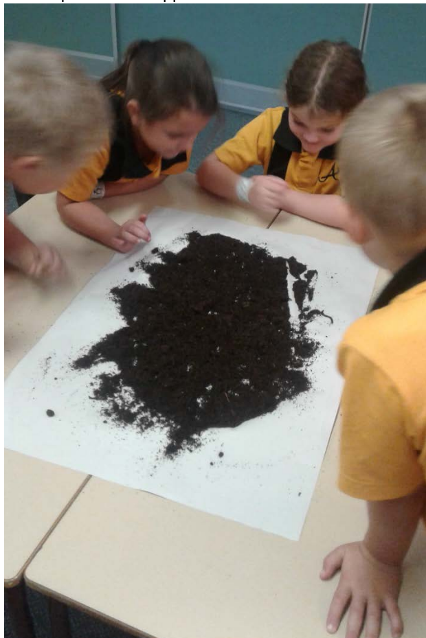
1/2 Yellow has worms!

We hope to see you at the assembly on Friday. We are performing our Eisteddfod piece, which was awarded second place at the Upper Hunter event earlier this month.