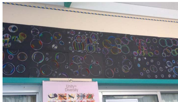
'Bubbling' along in 5 Green.

5 Green has been trialling BYOD in our classroom with a few students using their devices for literacy activities. I am hoping that more students are able to bring in their own devices over the next few weeks. We have been digging in deeper to our Gold unit, and end of term assessment notices will be going out this week. We had a big day last Thursday with our high jump, well done to those who participated. We finished our day off with some relaxing bubble art.