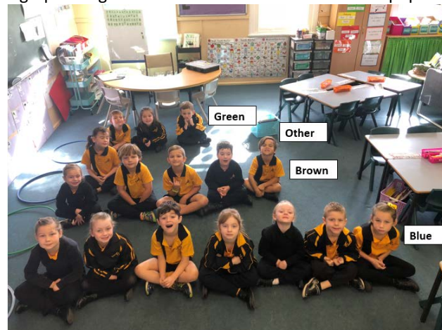
What eye colour do think was the most popular in Kindergarten Purple?

Wow, what a busy few weeks we have had in Kindergarten Purple. In Maths we have been looking at data. We have surveyed our class to find out what is the most popular eye colour in the class and our favourite colours. We then made a graph using our bodies to see what was the most popular.