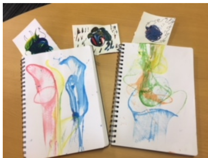
Budding artists show their talents in 6 Aqua

We have an Air Conditioner!!! No more cold chilly mornings here in Aqua. Our learning space is complete and we are making the most of it. Our artistic flair is in full swing as we are manipulating different painting styles to increase our skills with the brush. We have been analysing visual media and incorporating PowerPoint into our technology learning as another tool ready to use in high school.