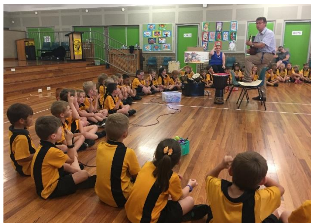
Kindergarten Music Concert

During the last week of term, we celebrated Anzac Day. Students visited a fantastic display set up by the local RSL sub-branch. The students were able to learn what soldier's eat, where they sleep, what they wear and carry. A favourite of all students was the camouflage face painting and wearing of the soldier's uniforms.