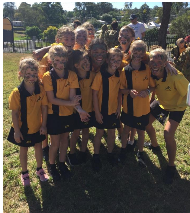
Photo bombed by Year 6 during ANZAC Day activities! 6M joined with 2/3 R to check out the army display.

Welcome back. I hope you all had a safe and restful break. Homework will start next week, please check your child's spelling to ensure they have written their spelling words correctly. We have a busy term ahead of us with the athletics carnival, Mother's Day and NAPLAN fast approaching.