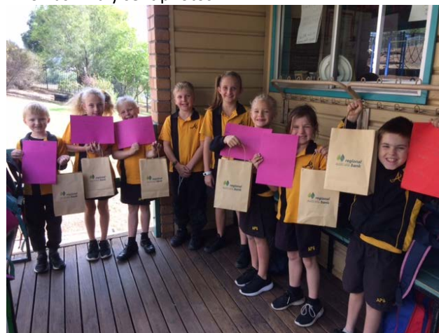
1/2 Lime winners of the 'perfect paragraph' competition

The number of baby photos received for our Living Things Science Unit has overwhelmed us. Thank you to everyone who has kindly sent photos in.