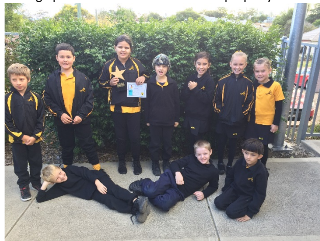
We won! Congratulations 2/3 Red.

Please remember to label your child's clothing to avoid it ending up in the 'black hole' that is lost property!