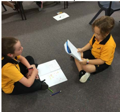
Playing battleship in maths to learn about coordinates

This week students in Year 3 will be taking part in their first NAPLAN testing. NAPLAN is a form of assessment that students participate in every two years and tests students' knowledge and skills in the areas of spelling, grammar, reading, writing and numeracy. To prepare for NAPLAN all students have been participating in preparation and revision tasks. The results from NAPLAN testing will be available for parents later in the year.