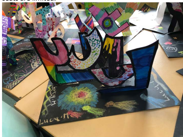
Magenta have been creating 3D name art

A reminder that the Expression of Interest form for the Stage 3 excursion is due on Friday.....please remember seats are limited.