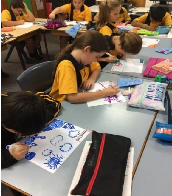
3/4 Black are developing visualising skills