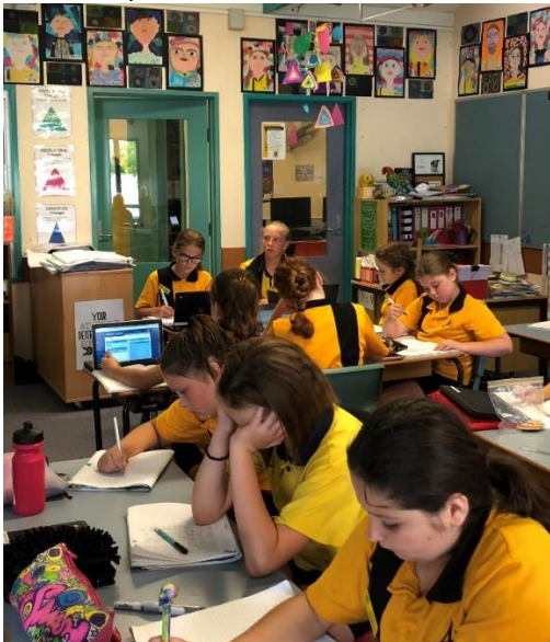
6 Magenta is hard at work

A reminder that money and orders for our Year 6 shirts are due this week. Please make every effort to get your order in to the office by Thursday as we will be only placing one order this year.