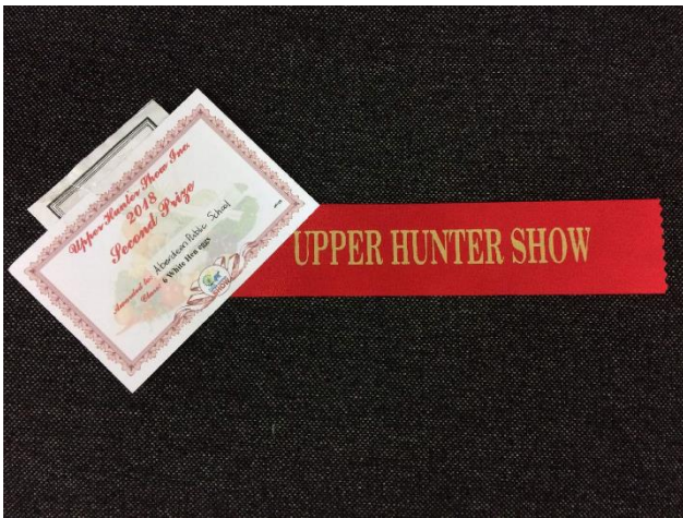
Second place for our six white hen eggs

Wishing everyone a very safe and happy Easter. Regards,