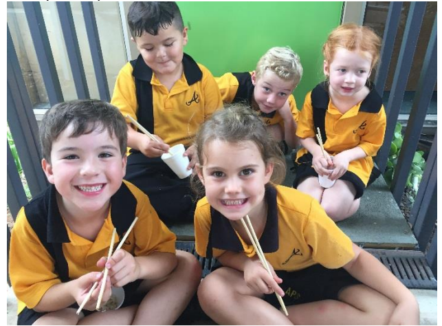
Kinder students enjoyed eating rice with chopsticks.

Due to the Easter break, KB will present their class item on Friday 6 th April.