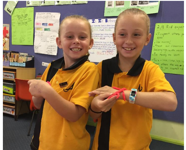
Making a model of a phasmid insect