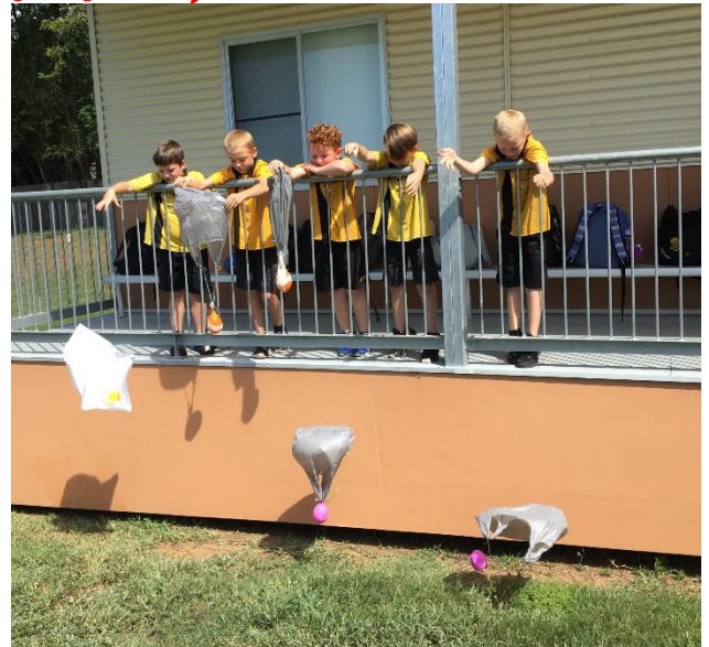
Water bomb parachutes