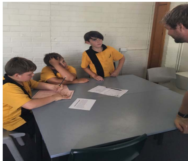
An Escape Room activity at Scone High School.

On Thursday, Year 4 students attended Scone High School and collaborated with students from Scone Public School for a day of Science, Technology, Engineering and Mathematics (STEM). The students participated in a range of activities including: bridge building, escape rooms and coding with Sphero bots. This was a wonderful opportunity to engage with the curriculum content whilst integrating future-focused learning. It was also a great opportunity to make some new friends.