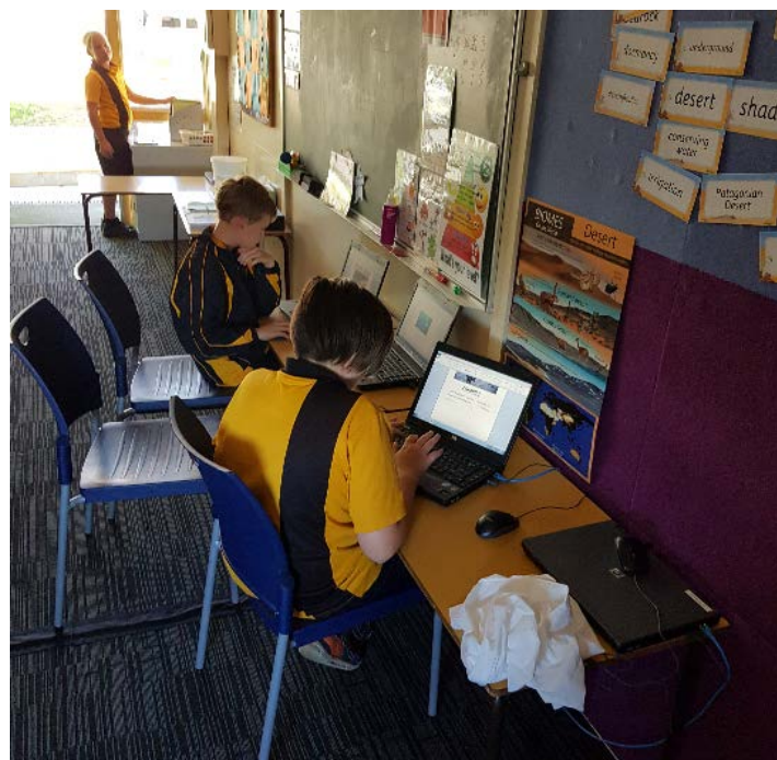
6 Aqua working on their music video.

What an outstanding week we've had in Aqua. A surprise assembly item saw us delve into what music in the 80's was all about... Big hair and bright colours! We rocked out and made our own music video and had a blast doing it. After all, the three R's are Reading and Rock and Roll!