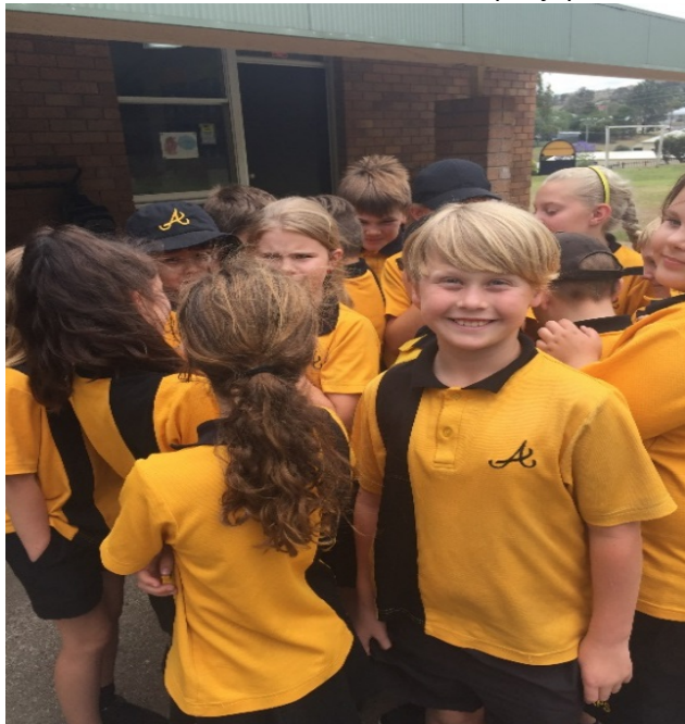
Learning about science through physical activity

In science, we have been investigating the way solids, liquids and gases behave. During the lesson pictured, students had to demonstrate the way atoms move depending on what form they take. This was enacted through role play, enabling students to learn about the scientific content of the lesson through physical activity. There were lots of smiles, so I assume they enjoyed it.