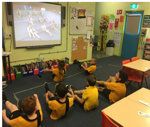
2/3 Red doing indoor fitness during wet weather

2/3 Red have worked very hard the last few weeks and it has been wonderful to see all our hard work coming together. Please remember to check your child's spelling list each Monday to ensure they have copied in their spelling words correctly. Please keep an eye on the newsletter and for any additional notes in your child's bag because we have a busy few weeks ahead of us, including Year 2 visiting Strathearn, the Mini Fete, and Presentation Day.