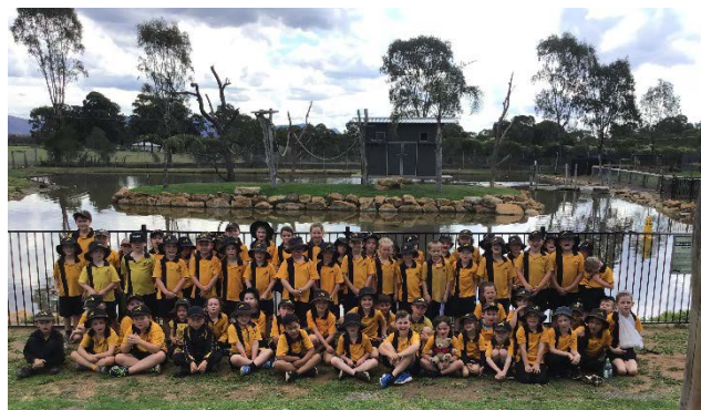
Hunter Valley Zoo was enjoyed by all who attended

http://nsw.tellthemfromme.com/ouraps2018