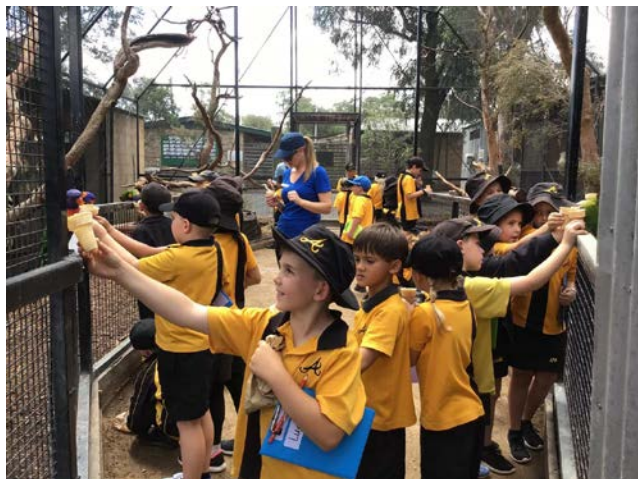
Getting up close with the animals