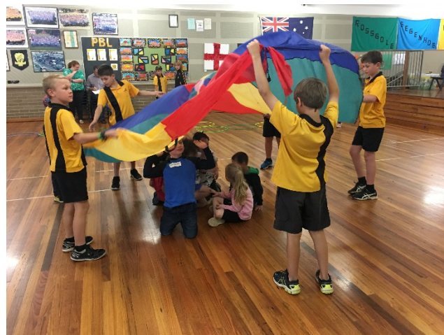
Having fun with our Early Bird Buddies.

Inspirational leader reports and portfolios are due this Friday to be eligible for school or sports captain roles in 2019. More information about nominations and speeches will be coming in the following weeks. There will be no set homework this term as Year 5 are expected to be completing their science fair projects, however unfinished classwork may be sent home for completion.