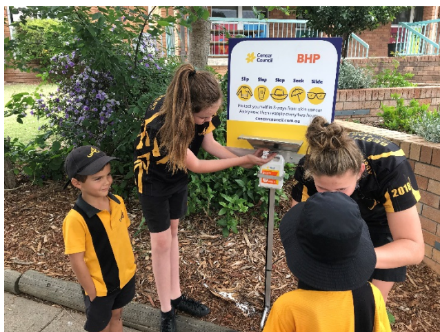
Our new sunscreen station in action.