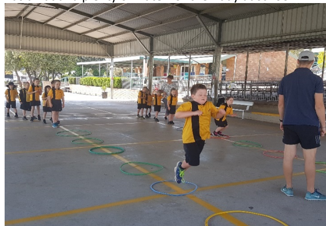
Enjoying morning P.E.

As the weather is warming up, please make sure your child has a hat and plenty of water for their day at school.