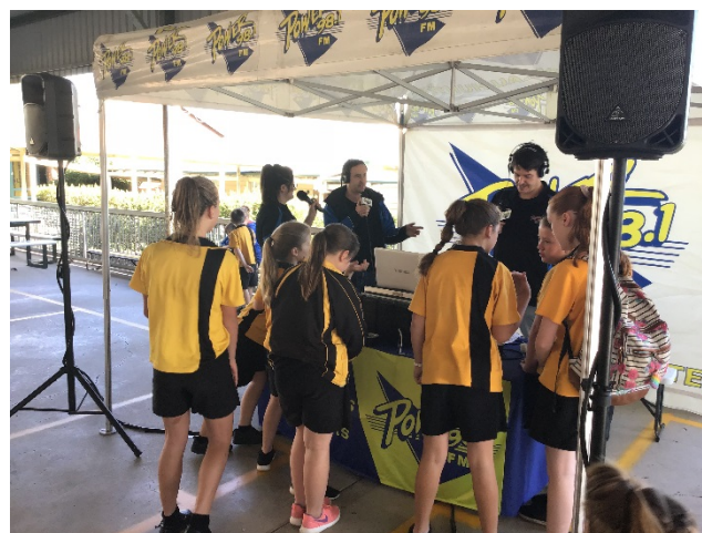
Power FM Breakfast was a hit!