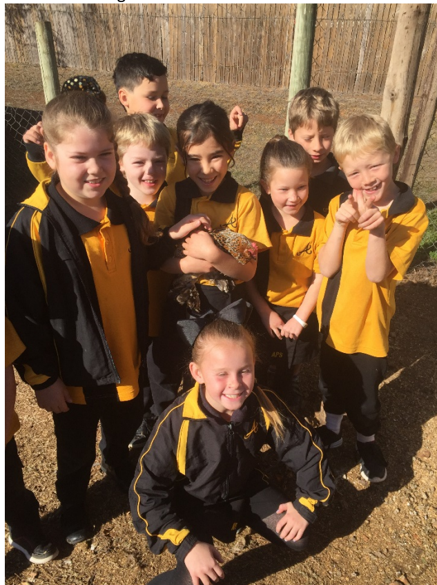
2/3 Red are now in charge of the school chickens. As you can see the chickens are now getting a lot of love.

Thank you to everyone who is up to date with all notes and payments. As the term progresses, the weather is starting to heat up so please make sure your child's clothing is clearly labelled as lost property is becoming quite mountainous again.