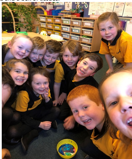
Learning about mixing colours in art with K Purple.

Please remember to send in supplies for the term, 3 x glue sticks and a box of tissues.