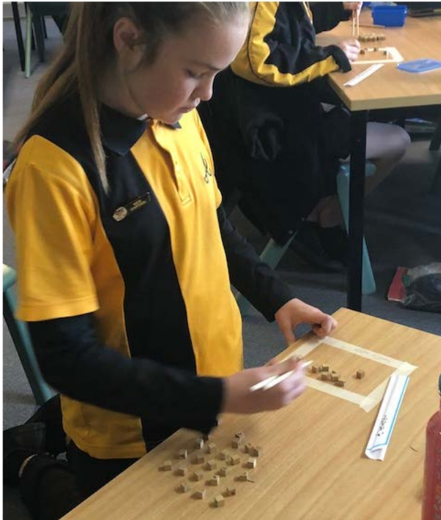
Magenta chopstick challenge!

Challenge. Ask your child what is involved in the challenge and if you have a set of chopsticks at home, why not set up your own challenge to rival them.