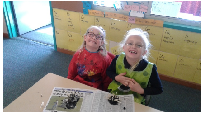
Echidnas for NAIDOC Week