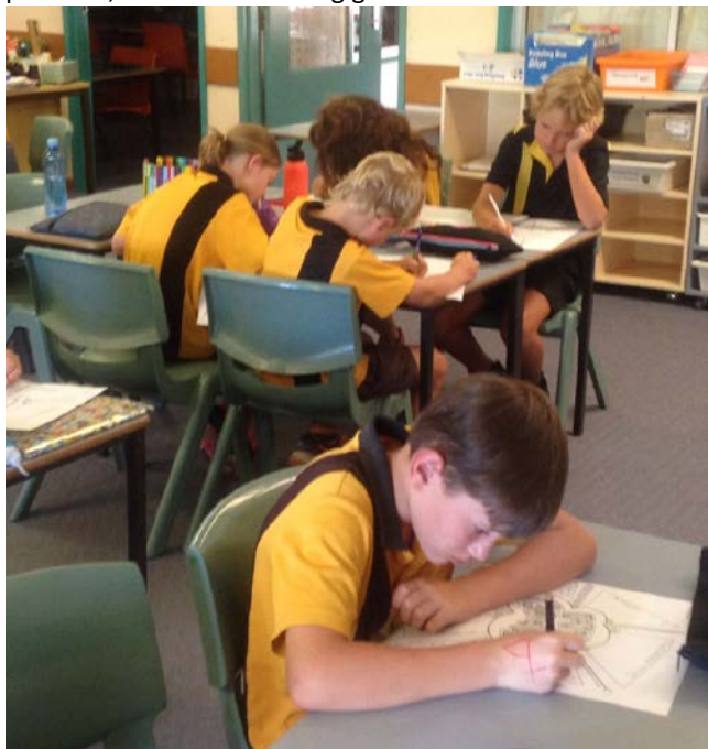
Goal setting is gold for these thoughtful students

This week students created their personal goals for this term. Please ask your child to share with you their personal, social and learning goals for this term.